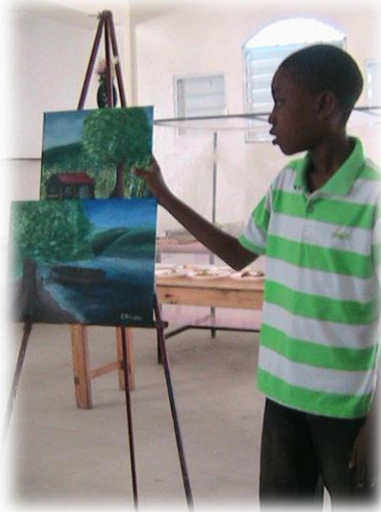
Sixth grader who is presenting his second year artwork

As the year came to a close, church members had a big cleaning day and enjoyed fellowship on January 1 st after the conclusion of church service. The faithful ones in the new believer's class recently received their own Creole bibles, which will help strengthen their walk with God. They are now learning how to use their bibles and how to understand the references. The leadership training classes have allowed us to learn many things we often take for granted in life such as: colors, seasons, church, how to teach and preach effectively, and our Savior Jesus dying to save us from eternal death.