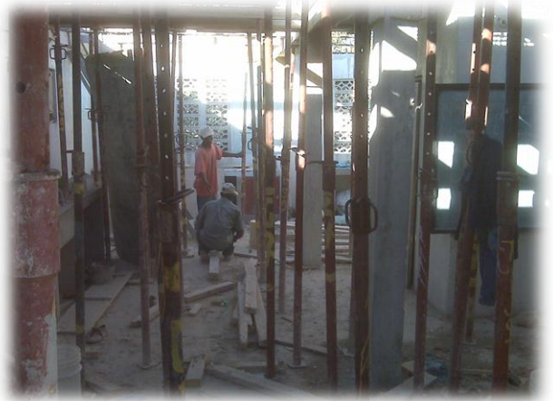
Interior view of cooking school construction