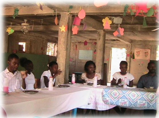
January 1 st : Church fellowship time