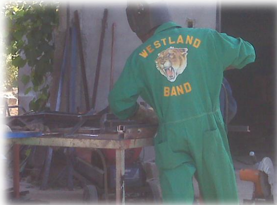
Welders working on church benches