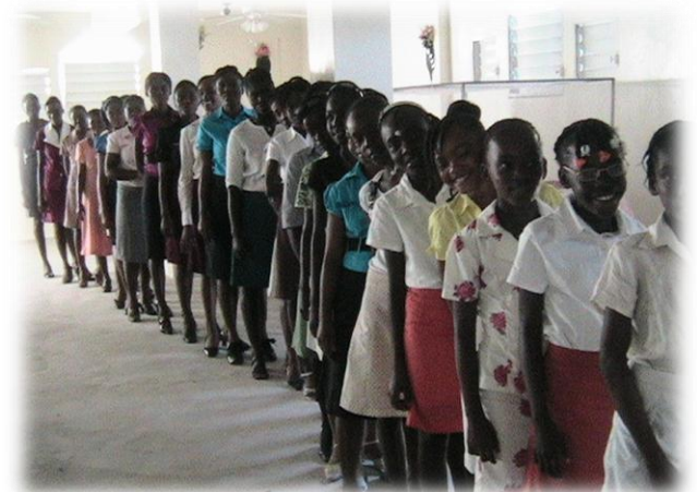
Sewing students line up for the style show

This newsletter is a publication of: Living Hope Ministries in Haiti P.O. Box 28366 Columbus, OH 43228-8366 (614) 851-0236