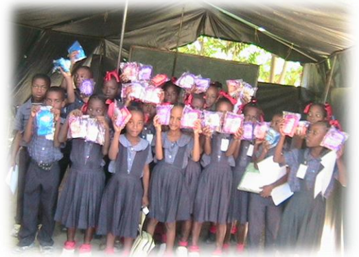
Receiving of Christmas Gifts

For the Christmas season, the primary school classes each prepared and performed a Bible-based skit during the final days of classes before Christmas break. All the children performed spectacularly! The trade school classes had their first trimester exams- theory and practical. In addition to these exams they had a style show, a cooking presentation, and an art presentation. All the students have done very well and we are so proud of all their accomplishments.