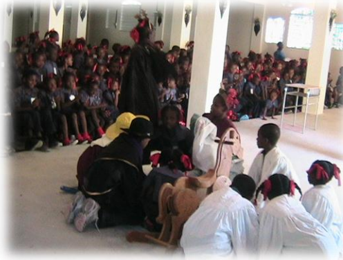
Third Grader's Bible-based Skit